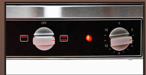
Now with more control of the cooking process