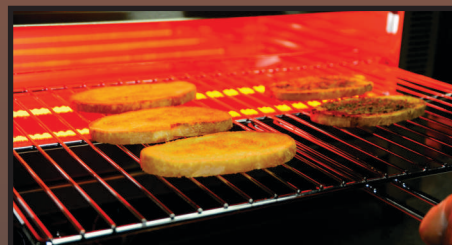
The instant heat of the infra-red elements