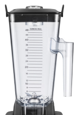
1.4 L Standard Container with Lid and Blade Assembly