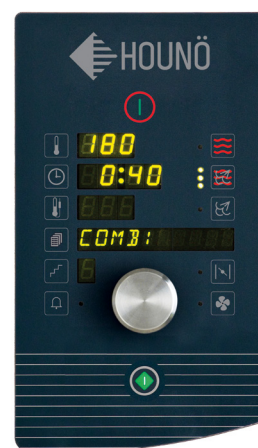
B standard model