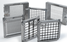
Modular Blade Assemblies

Precision sharpened stainless-steel blades are nested to avoid flexing