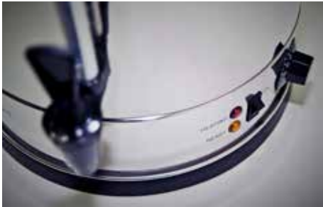
Indicator lights for practicality

Available in 3 sizes for whichever event you're organising.