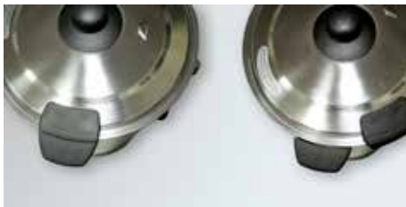
Lockable lid for added safety