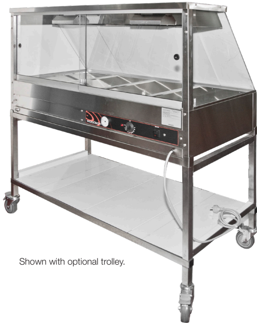
Shown with optional trolley.