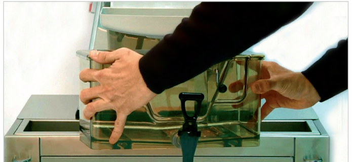
4. Take off the juice tank.