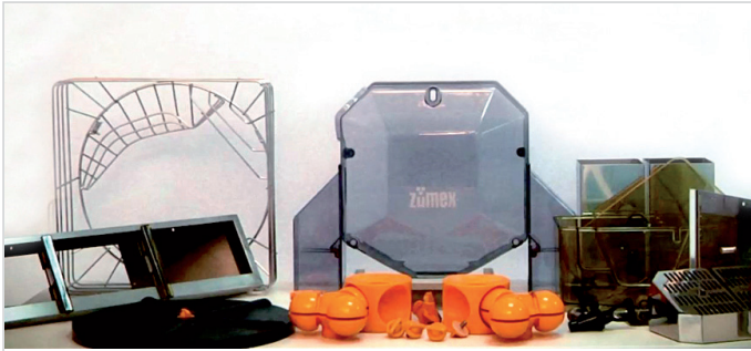
11. Replace the dismantled pieces with clean ones.

INFORMATION: All pieces, EXCEPT THE FRONT COVER , can be cleaned in a dishwasher. The juice extraction zone and the front cover should be cleaned using a moist cloth and dish washing liquid. Rinse with clean water to remove any washing liquid traces.