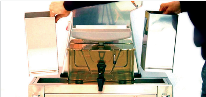
3. Take out the peel guides.