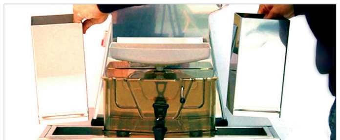
18. Mount the peel guides.