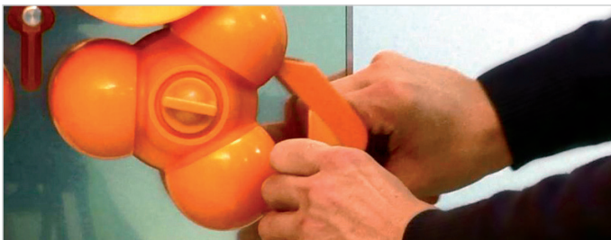
15. Put on the peel ejectors. Push them firmly to assure their right positioning in order to avoid breakage while using the machine.