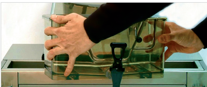
17. Mount the juice tank.