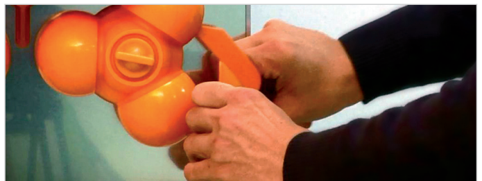
6. Pull off the peel ejectors.