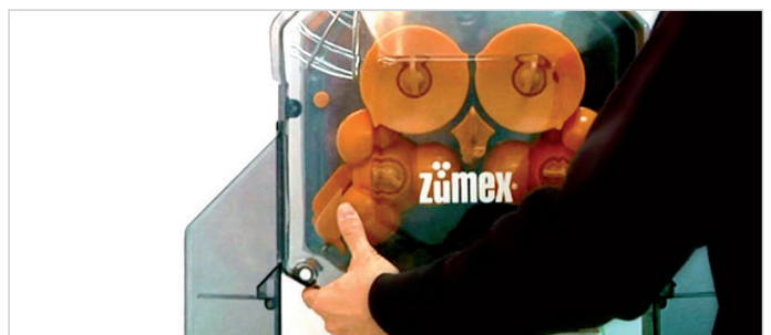
20. Put the plastic cover.