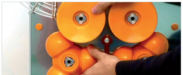
8. Take off the pressing units in pairs.