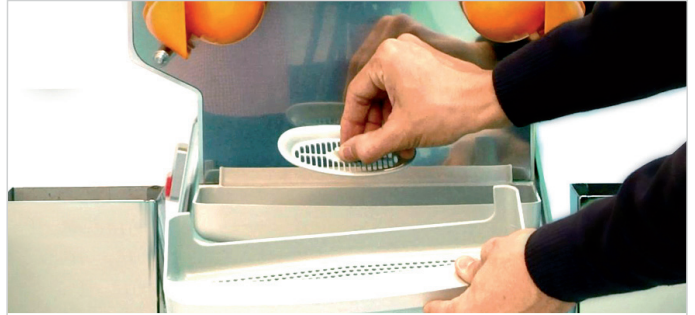
2. Take out the filters.