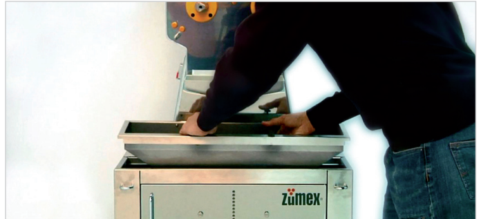
12. Mount the chute.