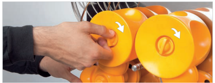
14. Fix the knobs and tighten them well. Missing knobs are to be replaced immediately. Never operate the machine with any knob missing.