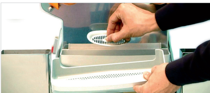
19. Insert both juice filters.