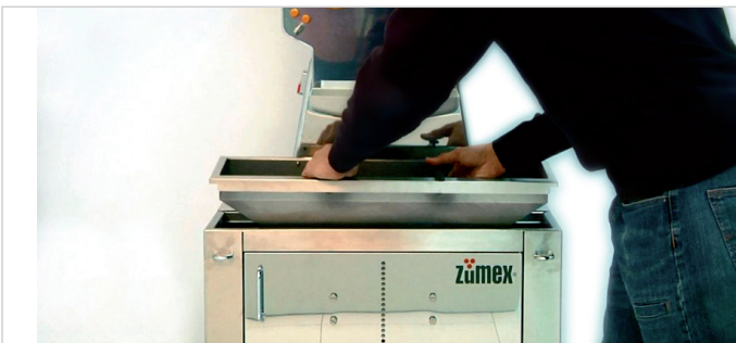
9. Remove the chute of the podium.