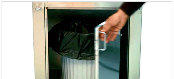
10. Empty peel bin.