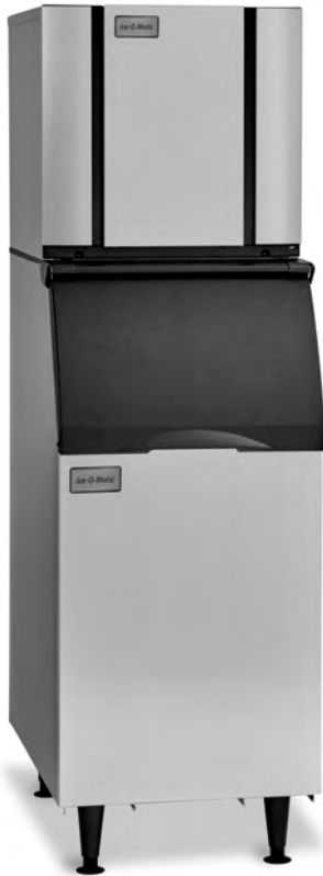
CIM1125 ON B42