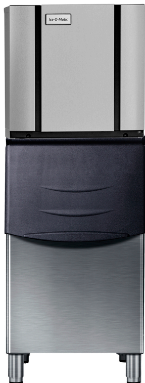
CIMO325 ON ICB110SC